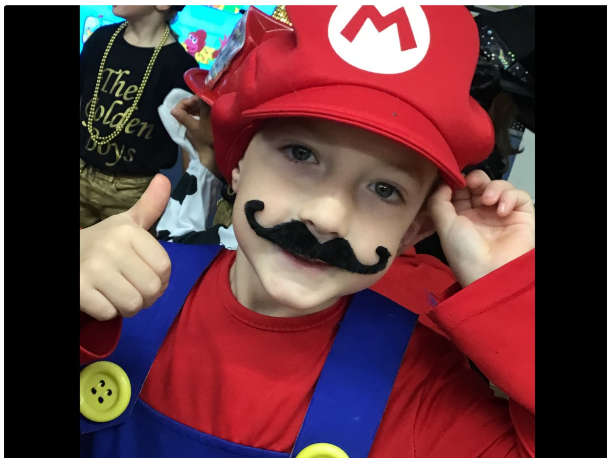
Fun times in Kindergarten!