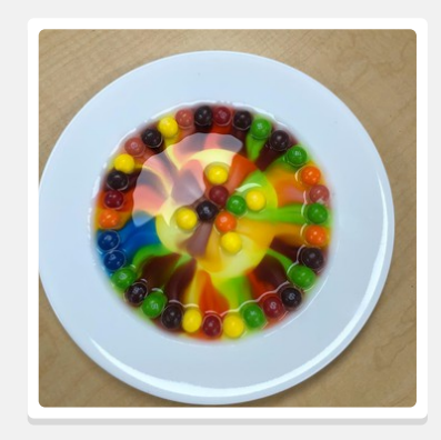
Science 5 Experiment fun!