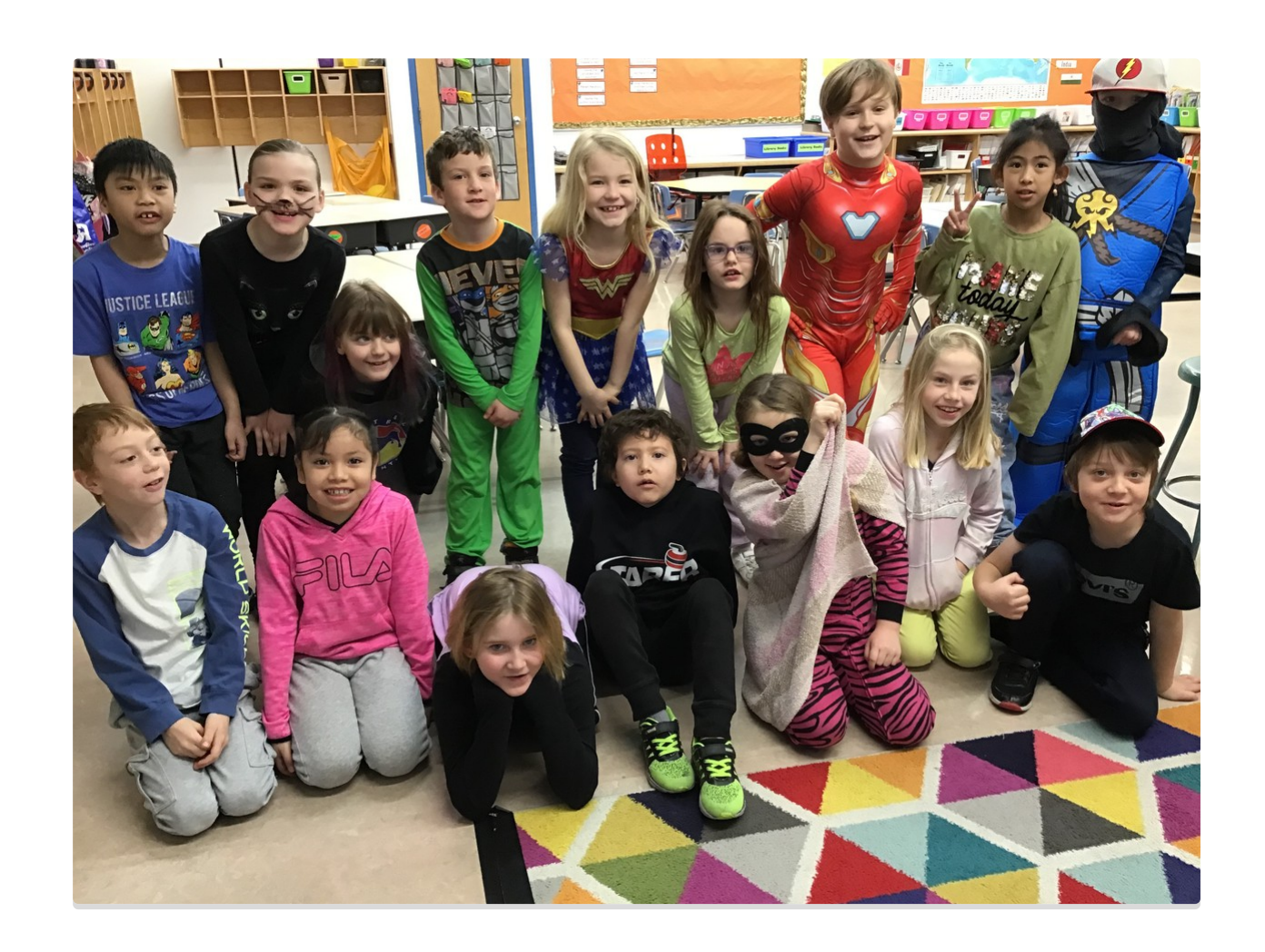
Have a FANTASTIC Week!